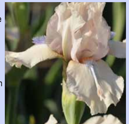
Reblooming IB ‘Concertina’

I know I am not the only one who thinks that kids today spend WAY too much time in front of a computer, and too little time outside in the garden. Kids love getting their hands dirty and seeing the results of their labors, whether it is growing flowers or radishes. Try to encourage your neighbors, grandchildren, nieces and nephews to grow irises along with their vegetables. If the First Lady can grow a garden, so can we. Sow the seeds. Happy Irising!