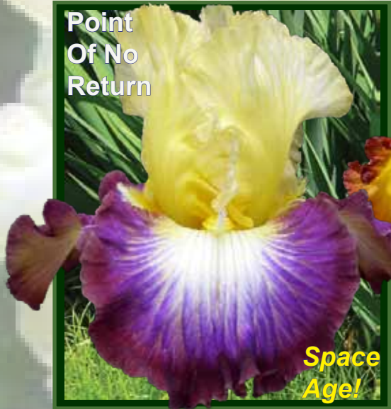
Point Of No Return