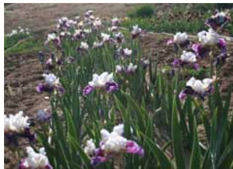
'Fashion Passion' in bloom at Stanton Iris Gardens

Rate of $80 per night for April 29 & 30, departing May 1. Mention Region 15 America for the discounted rate. Rooms are available in limited numbers, so make your own reservations early. If arriving at the hotel after the bus tour Saturday, please arrange for late check-in.