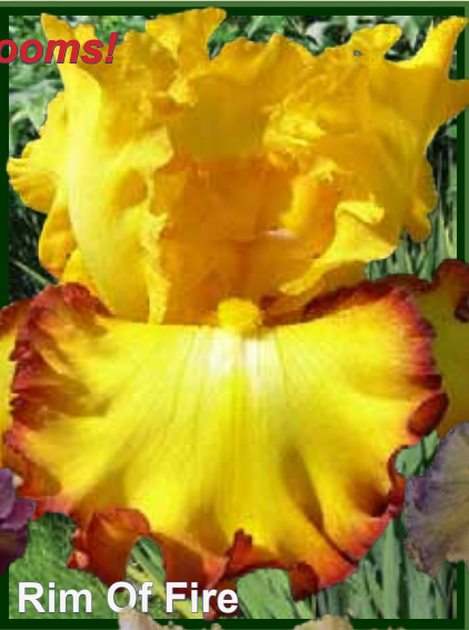
Rim Of Fire