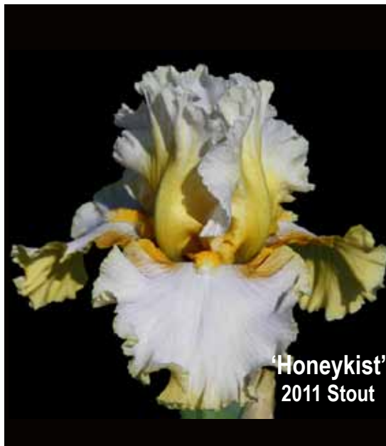
'Honeykist' 2011 Stout

Deadline for ads to be included in the Fall 2011 newsletter is July 1st