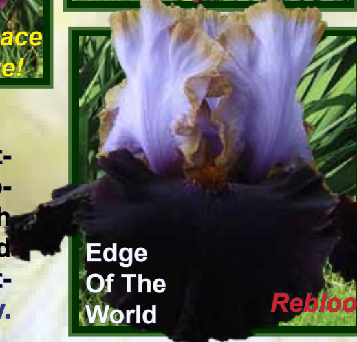
Edge Of The World

View these and Sutton's other 2011 introductions along with hundreds of bearded iris in our full color catalog or online at www.suttoniris.com