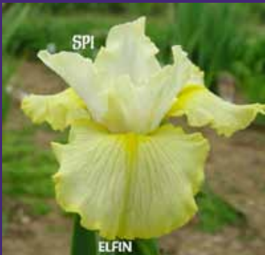
Spuria 'Elfin Sunshine'