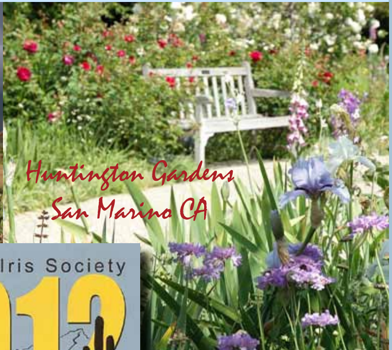
Huntington Gardens San Marino CA