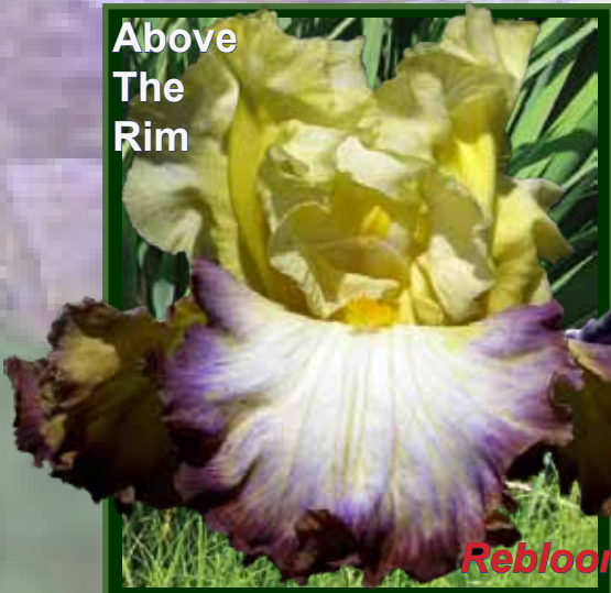
Above The Rim

Web www.suttoniris.com Email info@suttoniris.com