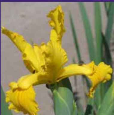
Spuria 'Butter Ripples'