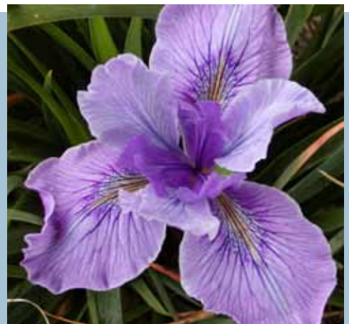
Photos of Pacific Coast Irises 'Idylwild', 'Canyon Snow' and 'Blue Moment' growing in Richard C. Richards' garden