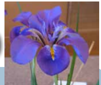
Tasco 2011 introduction 'Winter Echoes'

Visit the San Diego Iris Society Website at www.SanDiegoIrisSociety.org