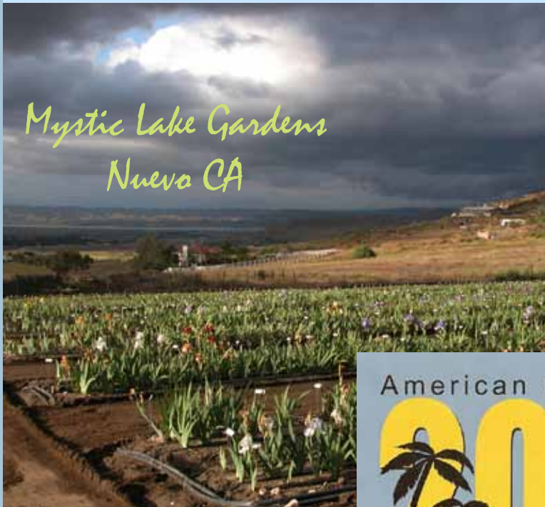
Mystic Lake Gardens Nuevo CA

Featuring Guest Irises at Four Fabulous Gardens in Southern California