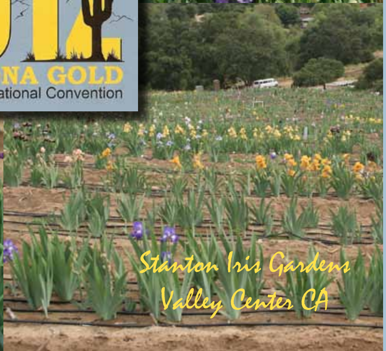
Stanton Iris Gardens Valley Center CA