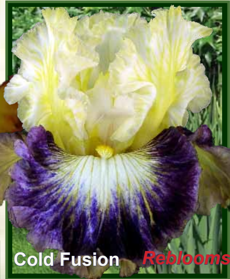
Cold Fusion Reblooms!

View these and Sutton's other 2011 introductions along with hundreds of bearded iris in our full color catalog or online at www.suttoniris.com