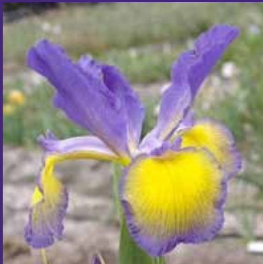
Spuria 'Clara Ellen'