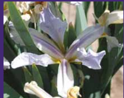
Spuria 'Amanda Eyes'