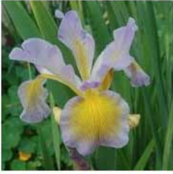
San Fernando Valley Iris Society

The San Fernando Valley Iris Society monthly Membership Meetings have included guest speakers and regular club functions.